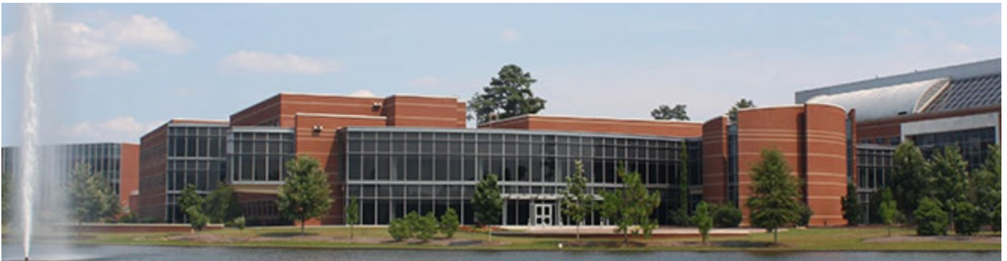
Figure 2: Robert F. Hatcher, Sr. Conference Center is the location for the 2024 GSRA Annual Meeting.

We all have a dream of a secure future with the benefits that were promised to us as employees, and our Teamwork will make our Dream work.