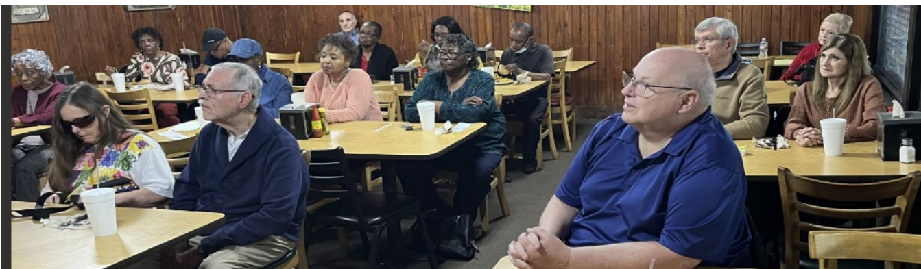
Figure 4: Thirty Macon-Middle Georgia Chapter members met on March 9, 2024.

The Macon Middle Georgia GSRA Chapter met on March 9th at Ole Time Country Buffett in Macon Ga. There were 24 members present on site and 6 were present via ZOOM.