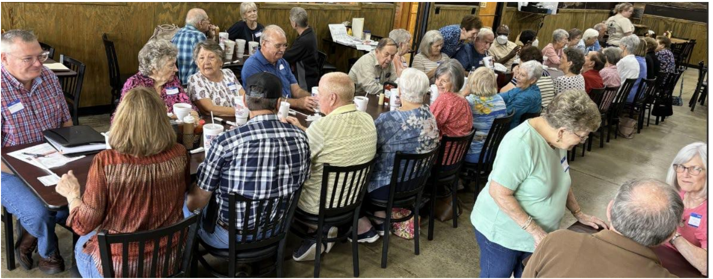
Figure 7: Thirty-nine members attended the August Tri-County meeting.

The Tri-County Chapter held its third quarterly meeting of 2024 on August 26th at Doodlum's Barbecue & Fruit Stand in Woodbury, with thirty-nine (39) in attendance. Updates were provided on the upcoming GSRA Annual Meeting in Macon on October 7th & 8th and the State Health Benefit Plan Open Enrollment this Fall. Everyone enjoyed a delicious lunch and fellowship. The next chapter meeting is planned for Monday, October 28th, at Doodlum's Barbecue Restaurant in Woodbury.