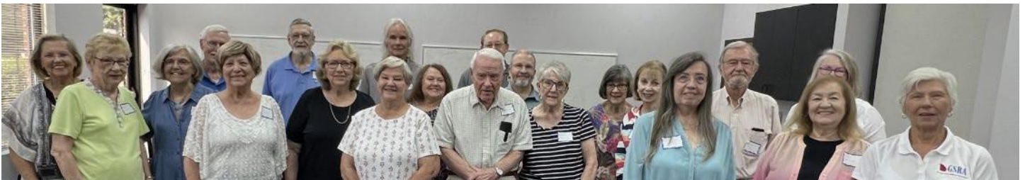
Figure 5: Twenty-two members met in Rome in August.