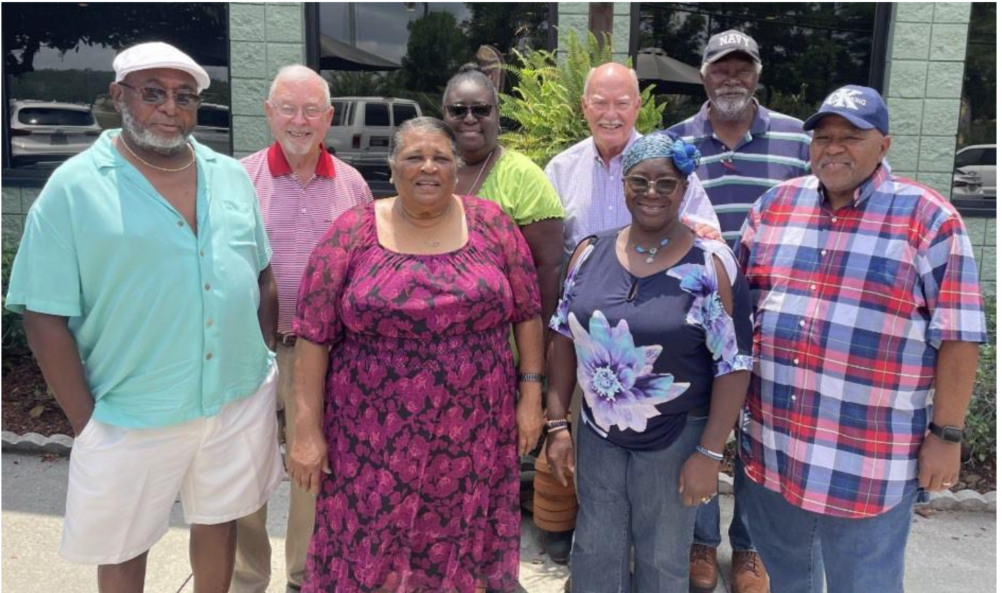
Figure 1: Tifton organization meeting attendees.