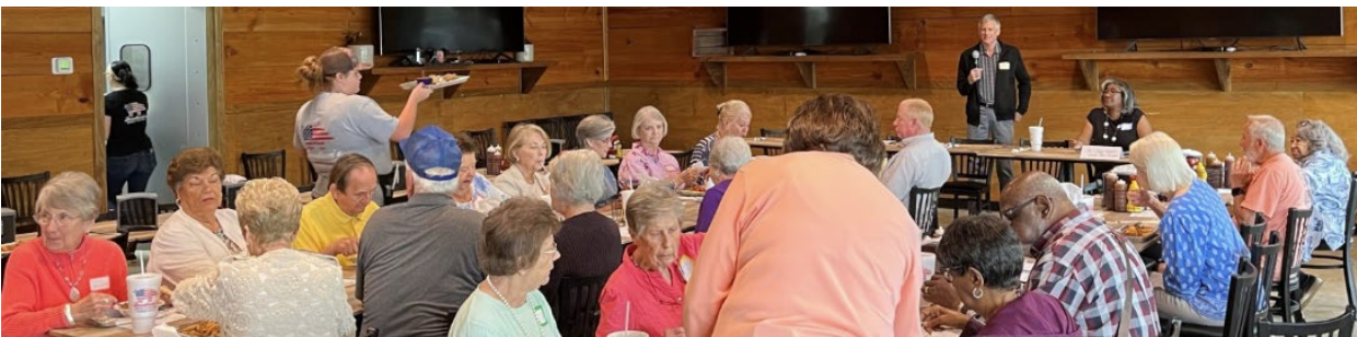
Figure 4: Tri-County members enjoyed a delicious lunch at its recent chapter meeting.

The Tri-County Chapter held its second quarterly meeting of 2025 on April 28 th at Doodlum's Barbecue & Fruit Stand in Woodbury with 28 members in attendance.