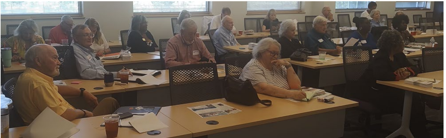
Figure 2: The Recruitment and Retention Roundtable, sponsored by AMBA, included participants from across the state.

Throughout the event, participants engaged in meaningful discussions, sharing their experiences, ideas, and challenges. The collective goal was to develop actionable plans to attract new members and retain existing ones. A notable segment highlighted the impressive work undertaken by GSRA's Savannah/Coastal Local Chapter over the past year. Their efforts provided an inspiring model for other local chapters.