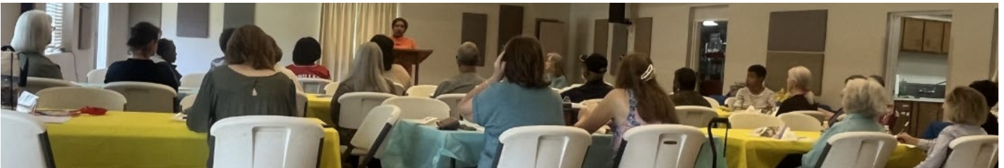
Figure 7: The Columbus Chapter had a productive meeting on May 20th.

The Columbus chapter held its quarterly membership meeting on May 20, 2025. There were 28 members in attendance.