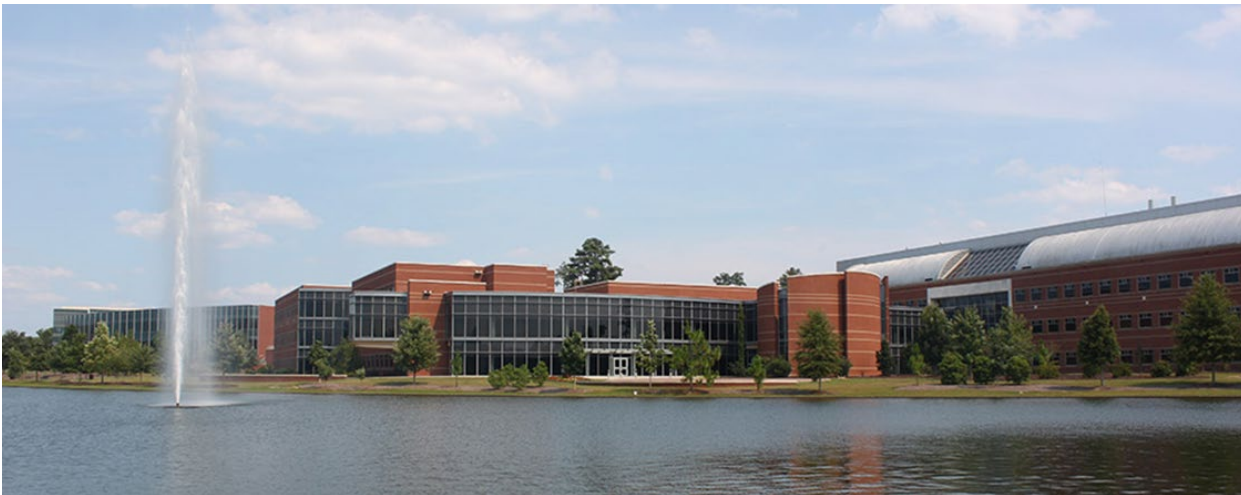
Figure 1: Last year's GSRA attendees overwhelmingly approved of the Robert F Hatcher Sr. Conference Center in Macon.

The GSRA Annual meeting will be held October 27-28, 2025 at the Robert F Hatcher Sr. Conference Center on the Middle Georgia State University in Macon.