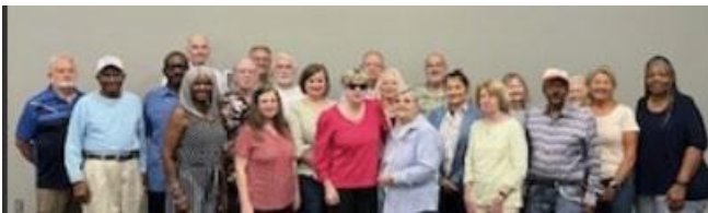
Figure 1: Twenty-five members attended the September NW Metro Chapter meeting.

GSRA's NW Metro Chapter met on Thursday, September 4, 2025, at Cobb County's Switzer Library in Marietta. Twenty-five members and guests were in attendance. It was a very informative meeting!