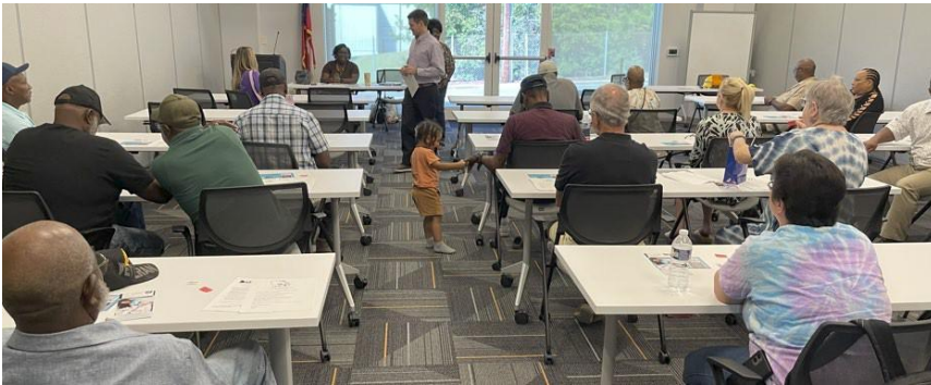
Figure 2: Tift GSRA Chapter members enjoyed multiple presentations during its September meeting.