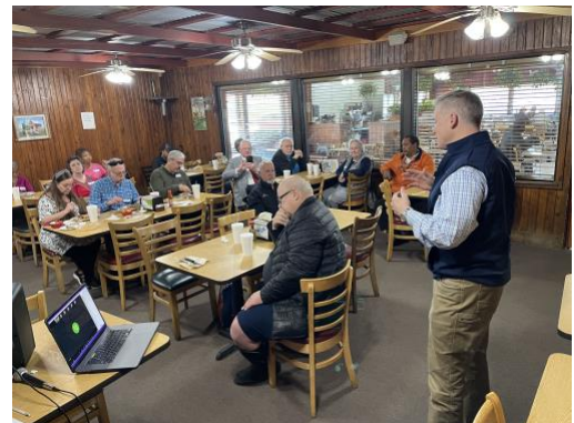
Right: Macon-Middle Georgia Chapter members listen to Senator John Kennedy

The chapter had several new members to attend this meeting and even had a few people sign up for pension deduction.