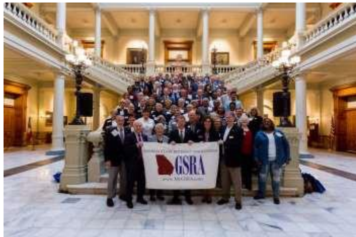
Members showed up to 2019's GSRA Day events in robust numbers. We need the same response in 2020 to ensure that we have the opportunity to converse with as many legislators as possible about the areas affecting state retirees.

Overall, there was only a 3% response from legislators to the GSRA Questionnaire. During GSRA Day at the Capitol, participants will have an opportunity to again ask their legislators these questions and, with those questions in hand, ask for answers!