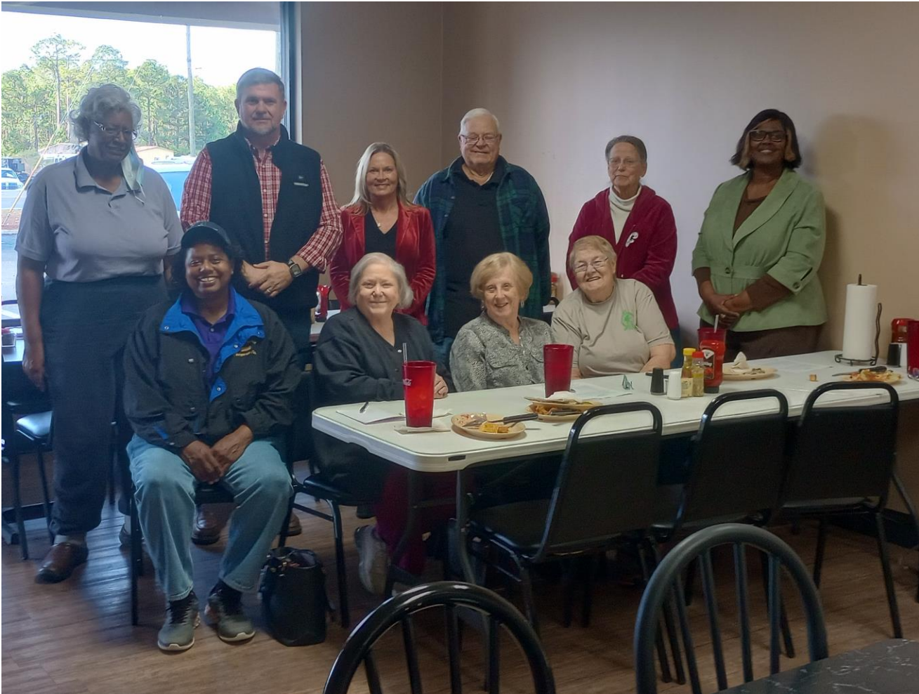
Figure 4: ABC Douglas Chapter members enjoying lunch.