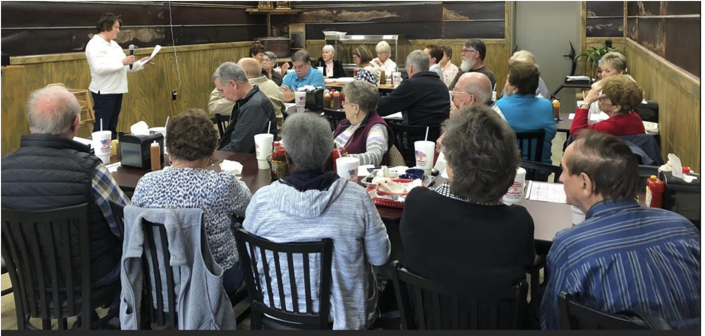
Figure 5: Tri-County Chapter members enjoyed lunch and an update on GSRA's legislative priorities.

The Tri-County Chapter held its first quarterly meeting of 2024 on January 29th at Doodlum's Barbecue & Fruit Stand in Woodbury with twenty six (26) members in attendance. The meeting began at 11:30 AM with an opening prayer. Everyone enjoyed a delicious lunch and fellowship. An update was provided on the 2024 legislative session along with GSRA's legislative priorities and ongoing efforts. Upcoming election dates for local and federal elections were provided as part of information sharing. The next chapter meeting is tentatively planned for Monday, April 29th back at Doodlum's Barbecue Restaurant in Woodbury.