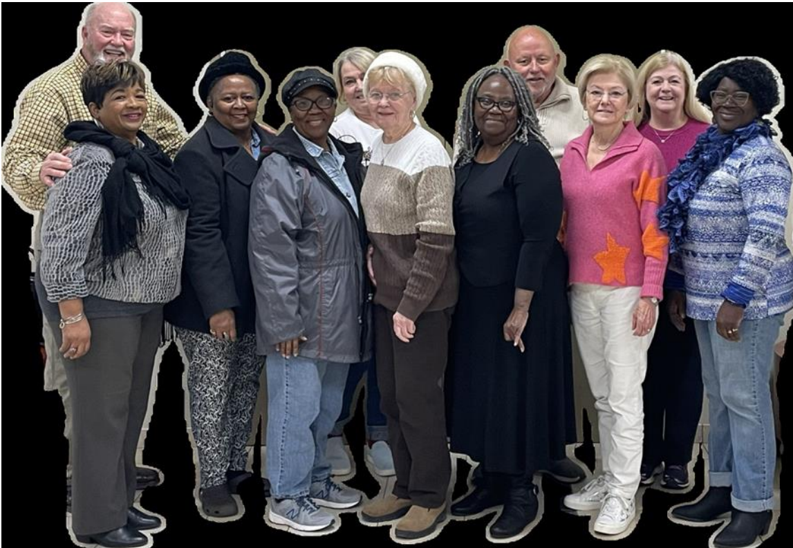
Figure 3: Southwest Georgia Chapter members.

The Southwest Georgia chapter met on January 17th at Albany State University's West campus.