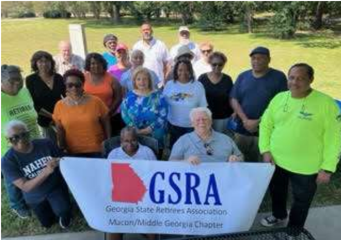
Some of the picnic participants are shown above

Macon-Middle Georgia chapter held a combination picnic/membership drive on Saturday, September 17 and it was a great success! Not only did they enjoy fellowship and good food, but they also attracted five new members, three regular renewals, one lifetime renewal, and promises from two people to go home and join online.