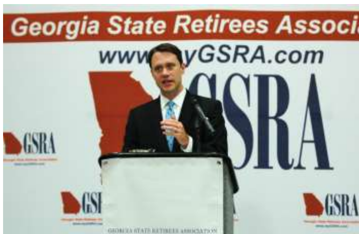
Senator Carter during his presentation

Carter continued that we need to recruit, retain, and support the best possible teachers and keep our promises. We need an economy that works for average people. Average median income is down $6,500; regular people need dollars in their pockets to drive our economy. Small business and the public needs the same breaks as big business. We used to want a government that is small and effective—now we just want small government.