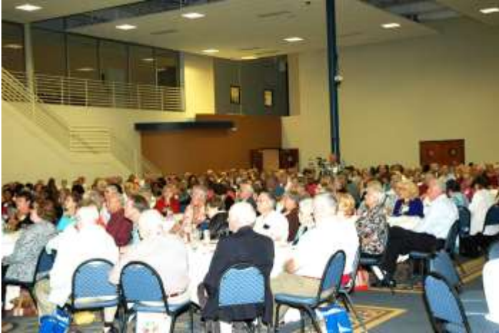
A packed house listens to the gubernatorial candidates on Oct. 7th

From GSRA members turning out in large numbers, to all three gubernatorial candidates addressing the gathering, with perfect weather thrown in for good measure, the 2014 GSRA Annual Meeting delivered in every aspect. The two day meeting, held October 6 th and 7 th at the Anderson Conference Center in Macon, built on the model inaugurated at the 2013 Annual Meeting by opening Monday with registration, Local Chapter Officers Training, and a fun and informative bus tour of historic Macon, capped off by a Welcome Reception for all members, guests, and participants Monday evening. Tuesday brought a full day of events, with concurrent workshop sessions conducted during the morning, followed by lunch. Members then participated in the Plenary Session before the main attraction, presentations by all three candidates for governor. In what is now an important tradition of the Annual Meeting, members were treated to door prize drawings at different times throughout day two, culminating in drawings for the final door prizes as the meeting drew to a close. At its conclusion, over 450 GSRA members, guests, presenters and exhibitors had participated in the 2014 Annual Meeting!