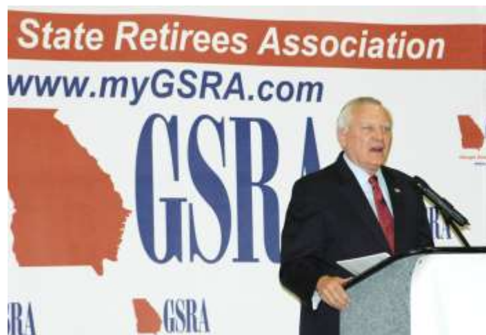
Governor Deal addresses the Annual Meeting

The Governor then addressed the question about the State Health Benefit Plan. He explained that the Department of Community Health accepted proposals from insurance vendors for the SHBP as a result of the old vendor contract expiring in 2013. The Department awarded the contract to one vendor; however, after hearing from members about the lack of choice in the contract, the Community Health Board immediately added copays for physician services at a cost to the health plan of $114 million in CY 2014. The Department has added two additional vendors for 2015 to provide a range of options to include the HRA, HMO and an HDHP. The Governor pointed out that the changes have been made even though the Affordable Care Act requires additional costs of $351 million for both the SHBP and Medicaid.