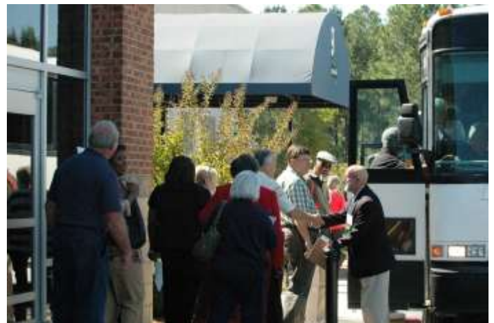
Participants board tour buses Monday afternoon