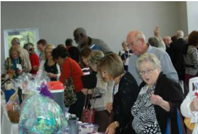
Members cast their tickets for the door prizes of their choice

hospitalization of the presenter, the Annual Meeting still offered three informative topics, SHBP – Preview of Changes for 2015 , Social Security Administration Overview , and Investing Advice , and GSRA members good-naturedly squeezed into the full venues for each. Before and in between sessions, members distributed their tickets for the door prizes of their choice in anticipation of the drawings later in the day. The concurrent sessions were followed by lunch for all in the auditorium, provided by UnitedHealthcare, where members had further opportunities for visiting and catching up.