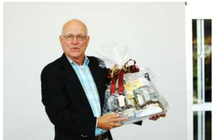
Lucky winner of one of the many great door prizes

After the candidate presentations, drawings for the final door prizes were held, as the 2014 Annual Meeting drew to a close. Based on the outstanding attendance by GSRA members, comments heard during and after the meeting, and the evaluations received from participants, GSRA leadership feels the 2014 Annual Meeting was our best yet!