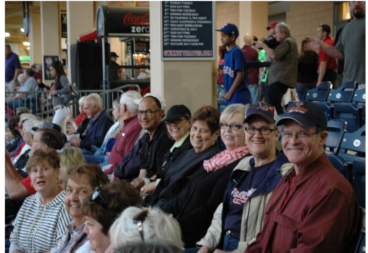
GSRA members enjoy the G-Braves game